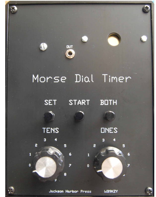
Finished kit in enclosure